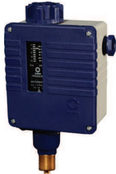
Pressure switch mechanical, model PSM-550